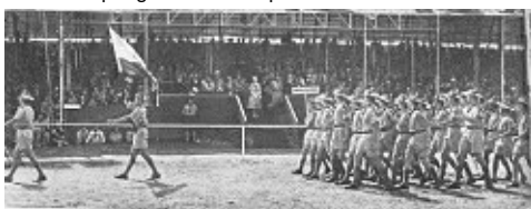
1957 Scouting 50 years. South Africa marches past the Queen in Sutton Park Arena England.